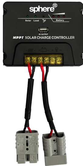
20A MPPT Controller