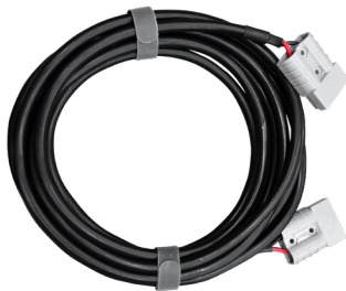
5m Extension Cable